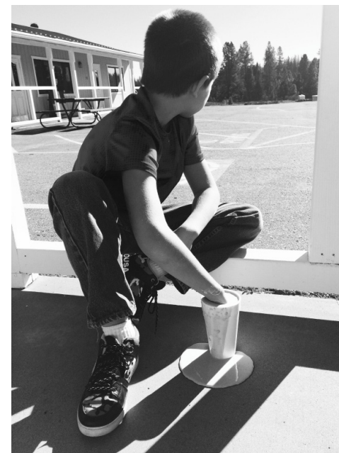
A student at Greeley Hill's Gold Rush Charter School makes an alginate mold of his hand while also using displacement to measure volume.