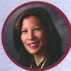
Chief Justice Tani G. Cantil-Sakauye